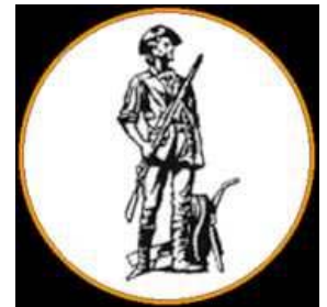
SAND SPRINGS SANDITES