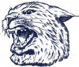
PONCA CITY WILDCATS